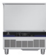
25/15 kg - 5 GN 1/1 External dimensions (wxdxh) 762x760x902 mm Electrical power - 1.58 kW