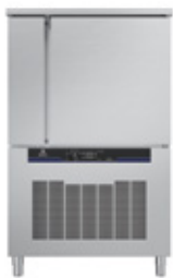
80/40 kg - 10 GN 2/1 External dimensions (wxdxh) 1000x955x1645 mm Electrical power - 3.96 kW