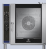
Crosswise Ovens Provides value for money, giving you peace of mind