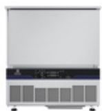
25/15 kg - 5 GN 1/1 External dimensions (wxdxh) 762x708x850 mm Electrical power - 1.58 kW