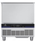
15/5 kg - 5 GN 1/1 External dimensions (wxdxh) 762x760x902 mm Electrical power - 0.73 kW

Our Blast Chiller Freezers range offers high strength and longevity. With its high durability, you can trust that your investment is sure to last for years to come, making it an excellent choice for those looking for a reliable, value for money and long-lasting solution.