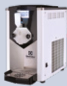
Ice Cream Machine Small, silent and powerful Soft Ice Cream Dispensers will make your business boom