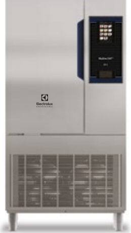
Choose the version with built-in UVC light for utmost hygiene.