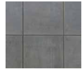
Floor tiles High performance flooring in porcelain tile with glazed surface