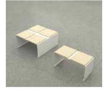
Furniture Galvanized and painted, bent and/or welded. Built to withstand the abuse of a coin laundry environment