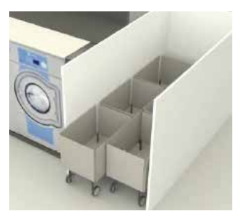
Laundry cart station Galvanized and painted, bent and/or welded.