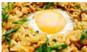
Fried rice with egg