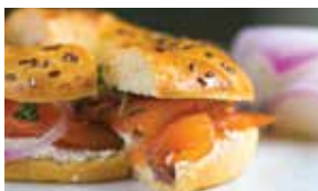
Crispy smoked salmon bites