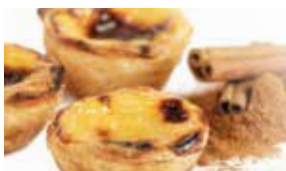
Pastel de nata