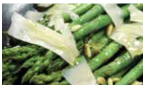
Asparagus and pecorino