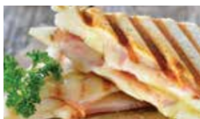
Ham & cheese toast

SpeeDelight: unlimited menus for unmatched business opportunities