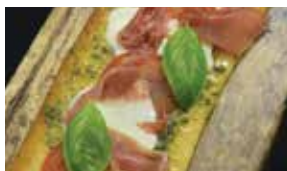
Mozzarella & ham flatbread