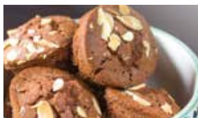
Dark cocoa sponge cake