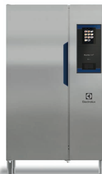
SkyLine Chill s Blast Chiller 220 lbs