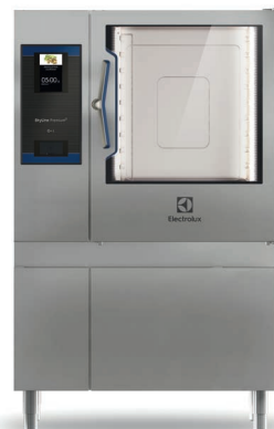
SkyLine Premium 5 Oven 10 Full Sheet Pans