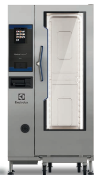
SkyLine Premium s Oven 20 Half Sheet Pans