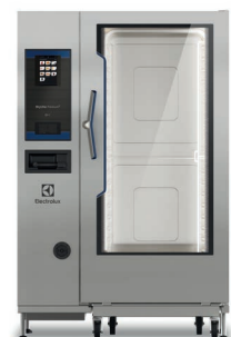
SkyLine Premium s Oven 20 Full Sheet Pans