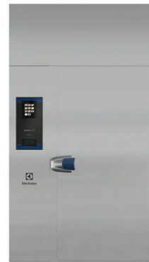
SkyLine Chill s Blast Chiller 440lbs

** Based on Electrolux Cook&Chill calculator, comparing Cook&Serve versus Cook&Chill method, both performed with Electrolux appliances. Data available in April 2019.