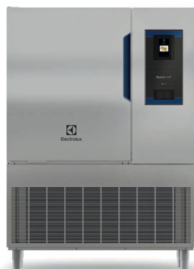
SkyLine Chill 5 Blast Chiller 220 lbs