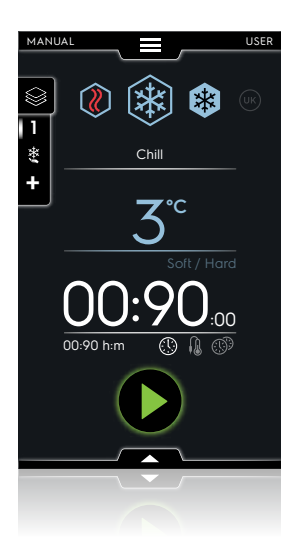
Ideal for demanding chefs

Keep a tight rein on all operations with total control over even the smallest detail. Design the personalization that fits you best.