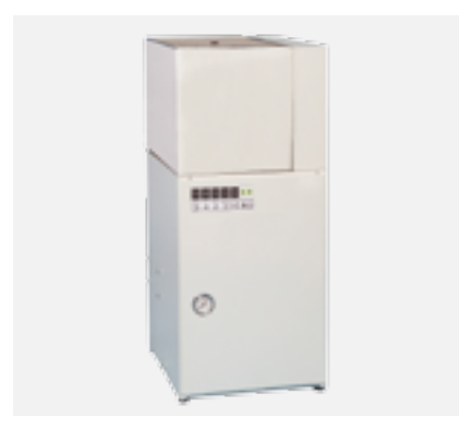
FSB24C Boiler 24 kW with condensate collecting tank