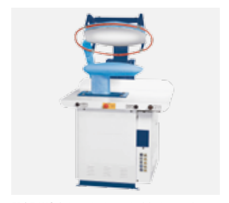
\textbf{FPA3-WC} \ \textbf{Automatic Laundry Mushroom Press}