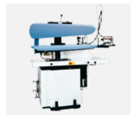
FPA1-D Automatic Cleaning Press with universal shape