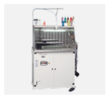
FSU4 Pre-Spotting and Pre-Brushing Cabinet with vaccum