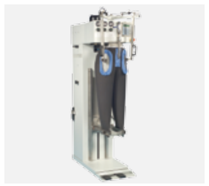
FTT2 Trouser Topper