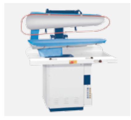
FPA1-WC Automatic Laundry Press with universal shape