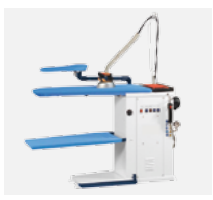
FIT2B Vacuum Ironing Table with integrated automatic boiler