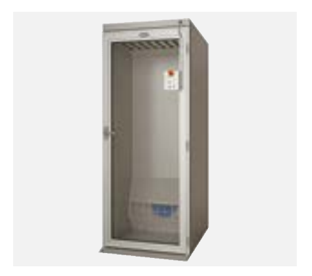
FC48 Finishing Cabinet 8 hangers