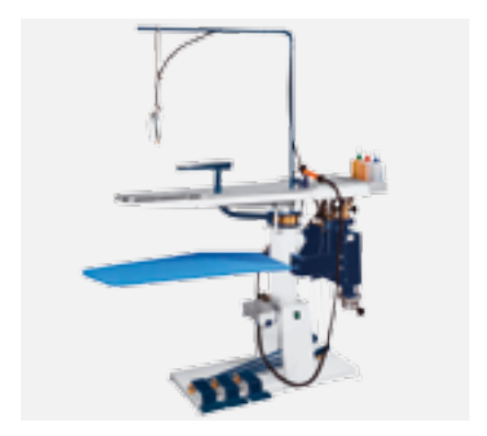
FSU3 Pre-Spotting Portable Table