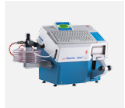
Y150 Marking Machine