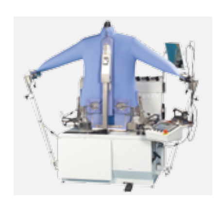
FSF2 Blowing Shirt Finisher FSF3 Pressing Shirt Finisher