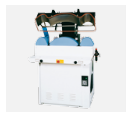
FPA6-WC Collar and Cuff Press