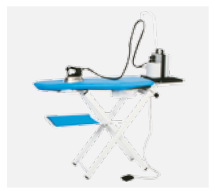
FIT1 Folding Table with manual boiler (2 hours) + iron