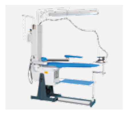
FIT1-WC Vaccum/Blowing Table (left ended) without boiler