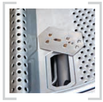
Lint lid on the drum Easy access for cleaning via drum and heating element inspection