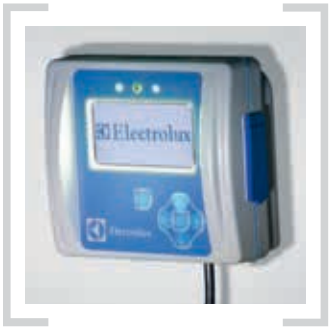
Superior efficiency and economy

The Efficient Dosing System automatically calculates the correct amount of detergents