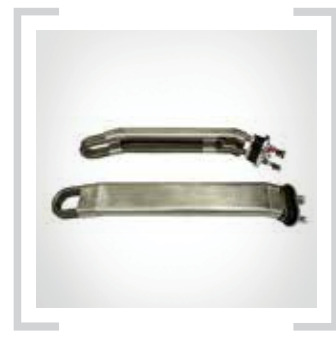
Covered heating element Highly resistant and anti lime