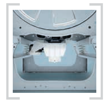
Electrical Drain Valve No pump system to avoid blockages

Create new programs directly on Clarus Control® panel or on your PC with Laundry Program Manager, then transfer them to machines via memory card