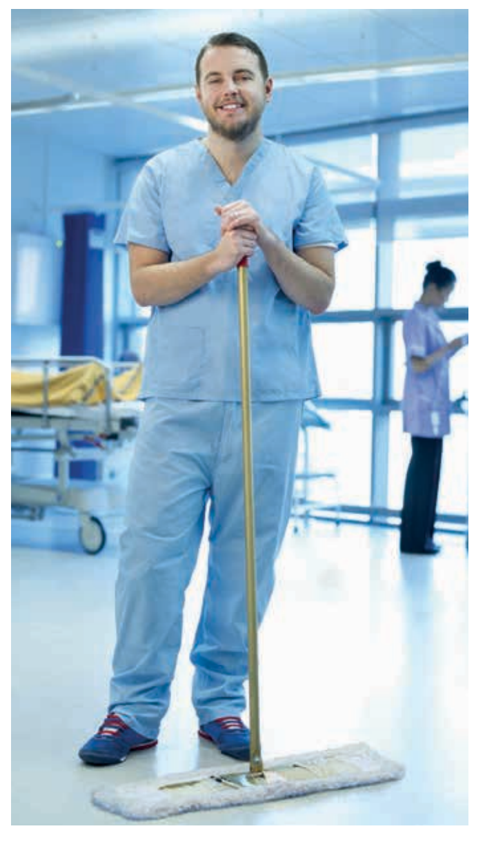
This simplified procedure frees up time, meaning that more cleaning can be carried out in less time, and with better results.