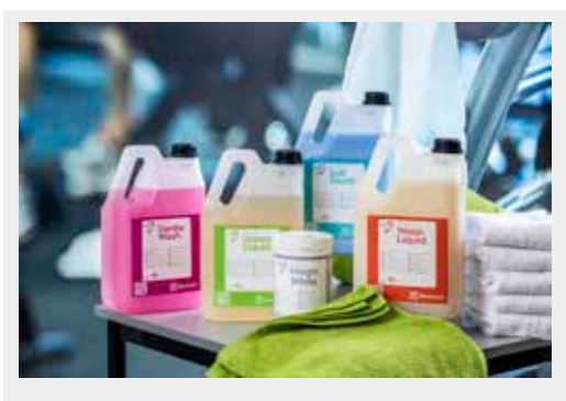
Cleanstar Detergents for clean and green wash results