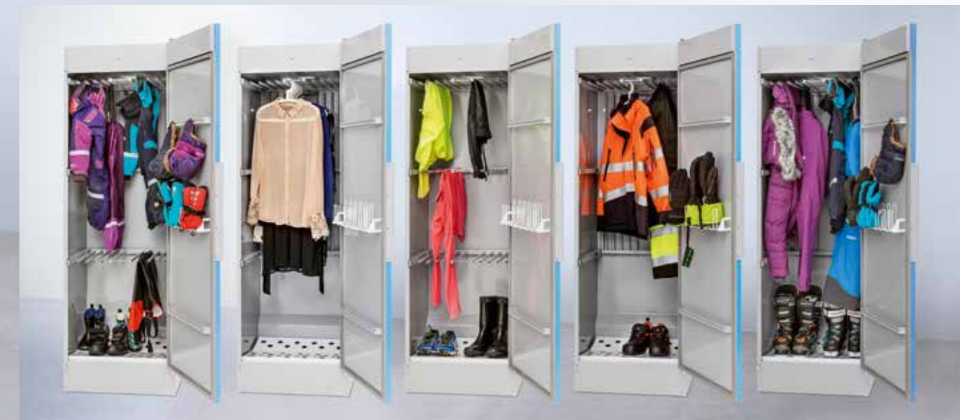
One Cabinet – endless opportunities