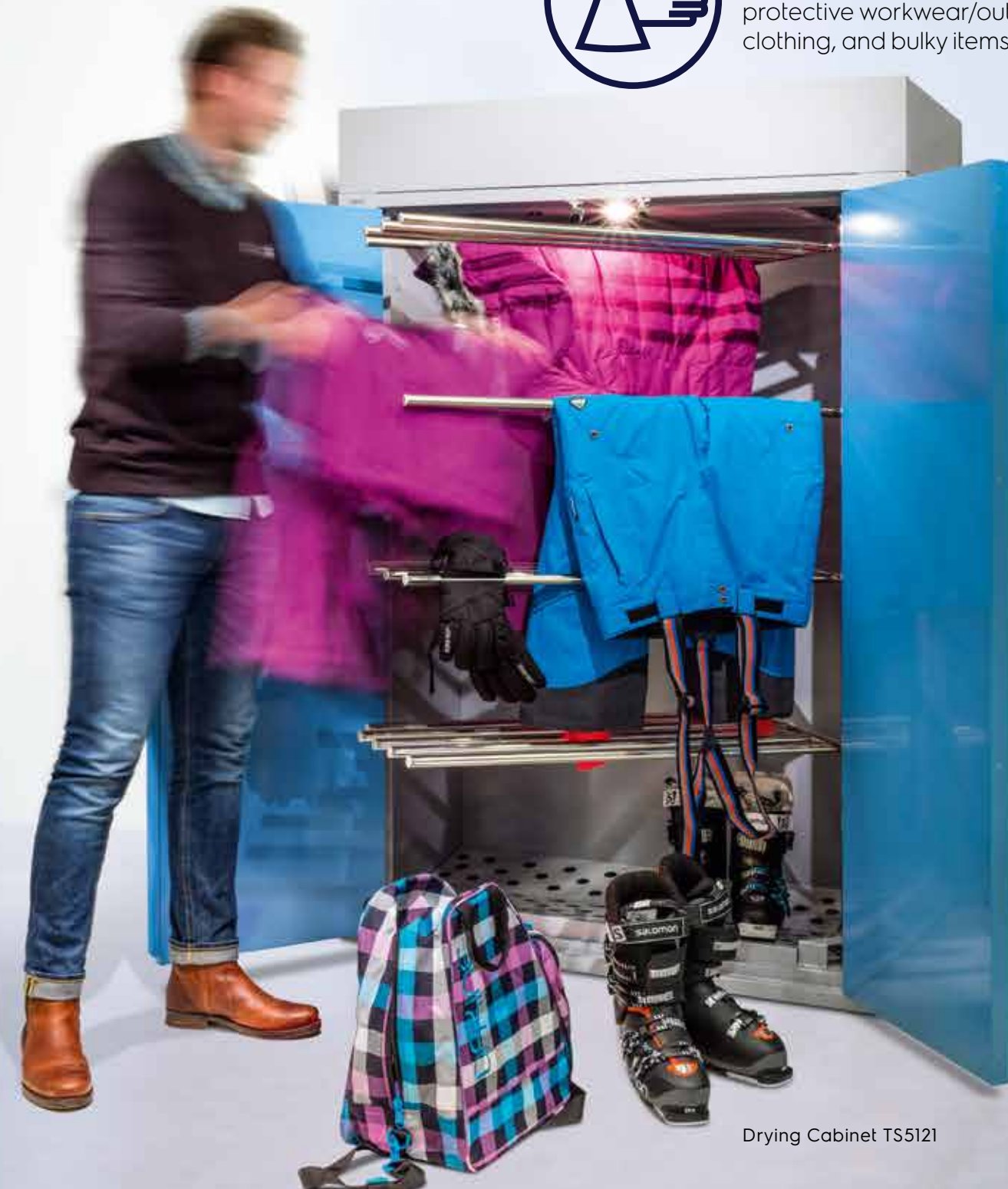
Drying Cabinet TS5121

Outstanding flexibility Designed for sensitive garments, protective workwear/outdoor clothing, and bulky items