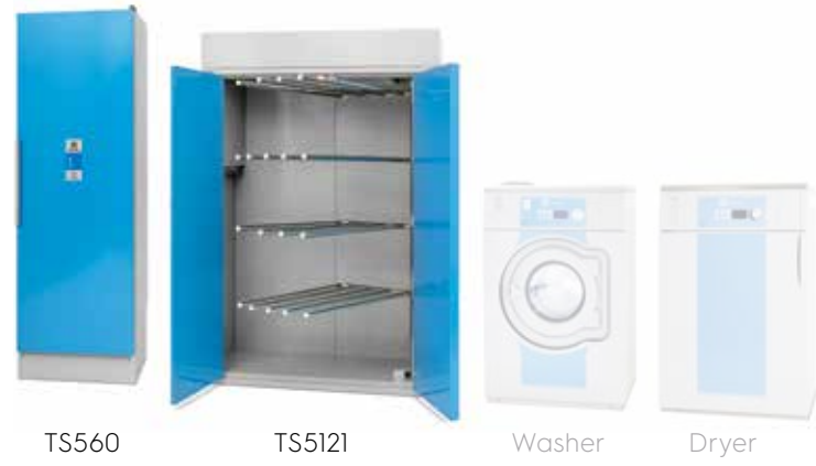
TS560 TS5121 Washer Dryer

Drying Cabinets are the perfect partner to our Washers and Dryers – the ultimate solution for maximum flexibility