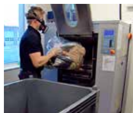
3. Bring the laundry bags into the "Red area" in the laundry and fill the barrier washer. Start the approved program.