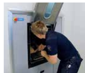
4. When the wash cycle is completed, take out the clean garments in the "Green area".