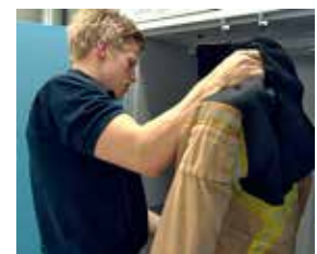
5. The clean and re-impregnated safety equipment is dried in a special designed drying cabinet.