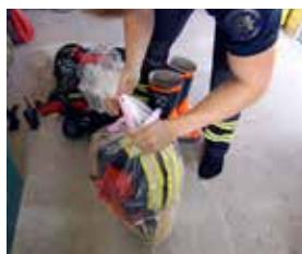
2. Place the safety equipment into soluble bags for the washing process.