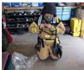
1. Remove the safety equipment on site after operations.