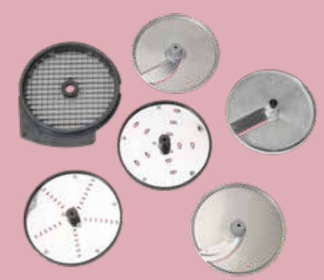
PNC 650197 Model SET6 (2mm slicing, 5mm slicing, 3mm grating, 7mm grating, 10mm slicing, 10x10mm grid)