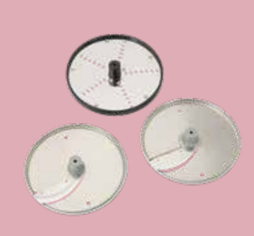
PNC 650196 Model SET3 (2mm slicing, 5mm slicing, 3mm grating)

Get started immediately with a pack of multiple discs