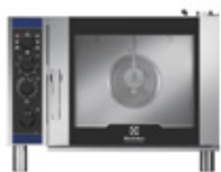
6 GN1/1 Smart Steam version External dimensions (wxdxh) 860 x 766 x 633 mm Electrical power - 7.7 kW