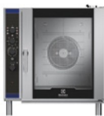
10 GN1/1 Smart Steam version External dimensions (wxdxh) 890 x 910 x 950 mm Electrical power - 17.3 kW