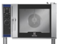
6 GN1/1 External dimensions (wxdxh) 860x766x633 mm Electrical power - 7.7 kW Gas power - 8.5 kW + 0.35 kW (electric)

Our range of Convection Ovens Crosswise offers efficient cooking and delivers delicious, consistent dishes to your customers. With excellent value for money, our range is the perfect investment for any food service establishment looking to optimize their operations.