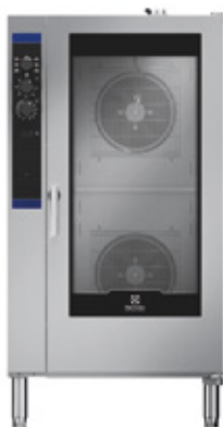
20 GN1/1 External dimensions (wxdxh) 890 x 915 x 1,750 mm Electrical power - 34.5 kW Gas power - 35 kW + 0.5 kW (electric)