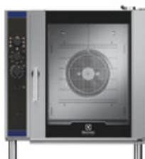
10 GN1/1 External dimensions (wxdxh) 890 x 910 x 950 mm Electrical power - 17.3 kW Gas power - 18.5 kW + 0.35 (electric)