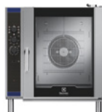
10 GN2/1 External dimensions (wxdxh) 890 x 1,225 x 950 mm Electrical power - 24.5 kW Gas power - 25 kW + 0.5 kW (electric)