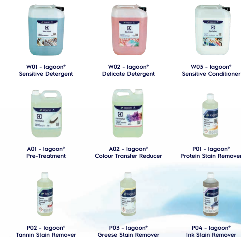
W01 - lagoon® Sensitive Detergent

lagoon® Advanced Care operates with two detergents and one conditioner. Four prespotting, one prebrushing agent, plus an additive to reduce the risk of colour transfer, complement the process.